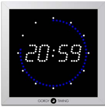
Réf 93000011 Bi-colour