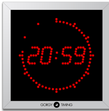
Réf 93000024 Tri-colour