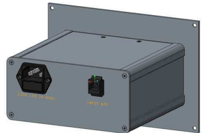
Back face for NTP/230 VAC Version Cable supplied: 3m Ethernet CAT5E, and 2 m Power AC EU/IEC C13.

Remote configuration and time setting via WEB interface. Automatic time zone choice and daylight saving time change. Supervision via SNMP, configuration via Telnet, IP configuration with 'GT Network Manager' (Windows® NT/XP/2000/Vista (32 bits)/ Windows 7)